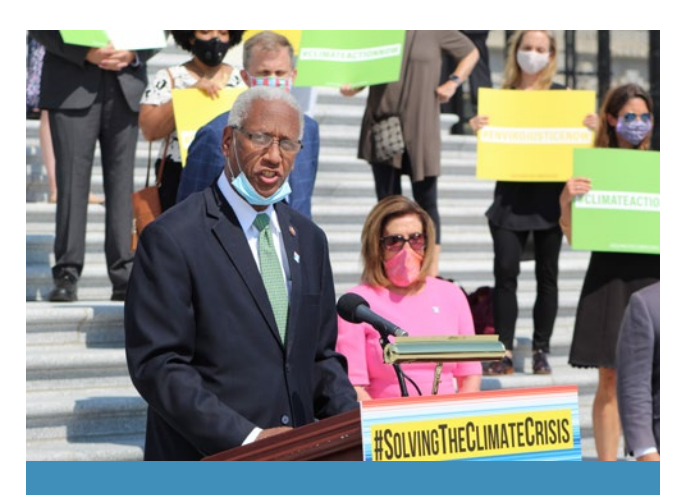
Rep. McEachin at the House Select Committee on the Climate Crisis Report Launch Press Conference

Rep. McEachin announcing the founding of the UCEJTF